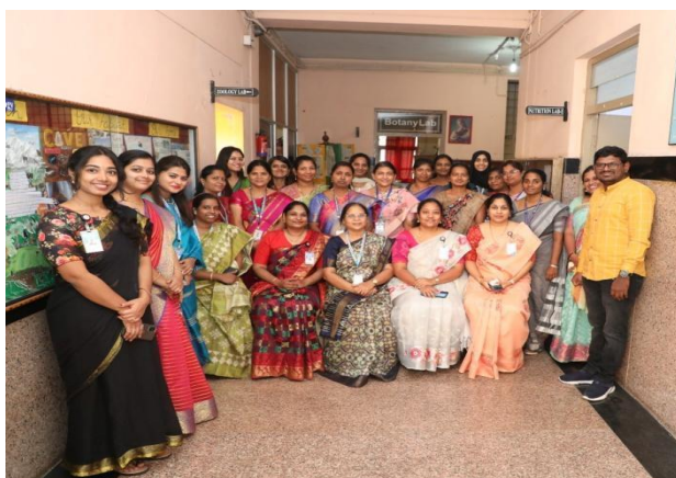
Group photo of all participants