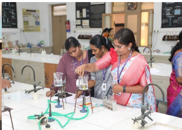
Qualitative Analysis of Biomolecules