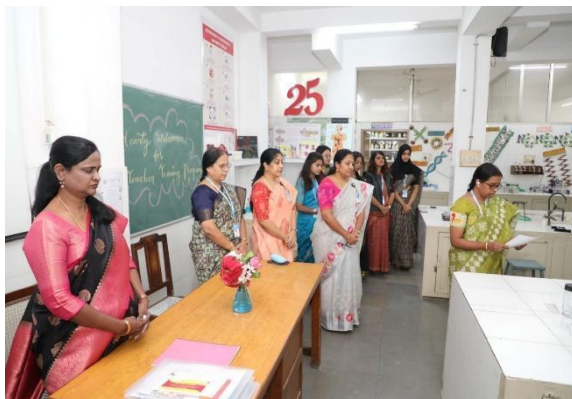
Inaugural of the Workshop