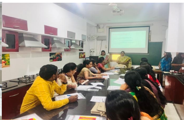
Session on Importance of Balanced Diet