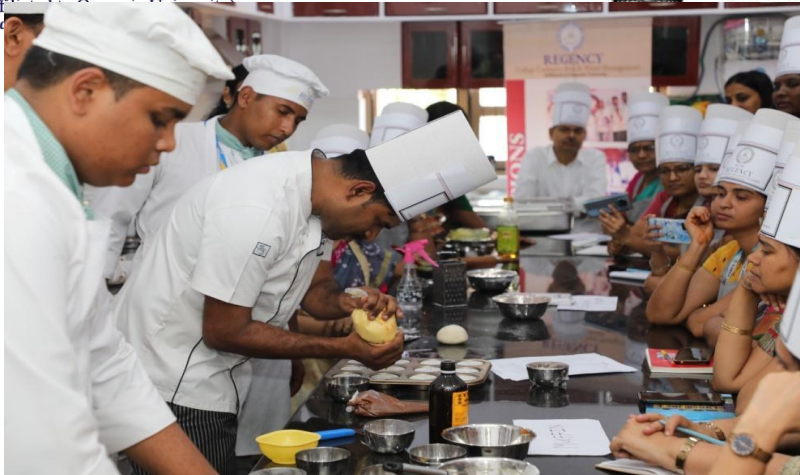
Chefs at Work

जैवप्रौद्योगिकी विभाग DEPARTMENT OF BIOTECHNOLOGY