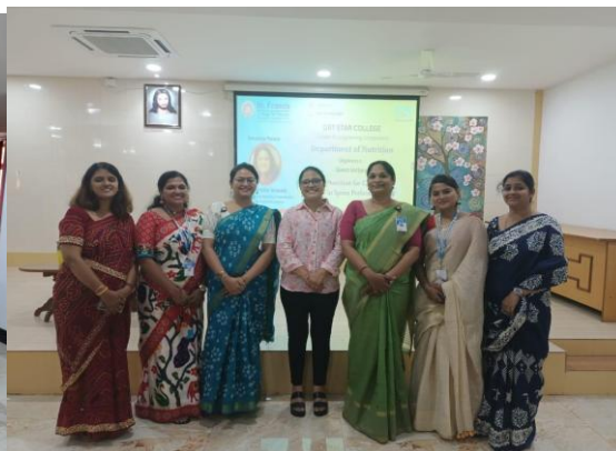
Faculty Members with the speaker