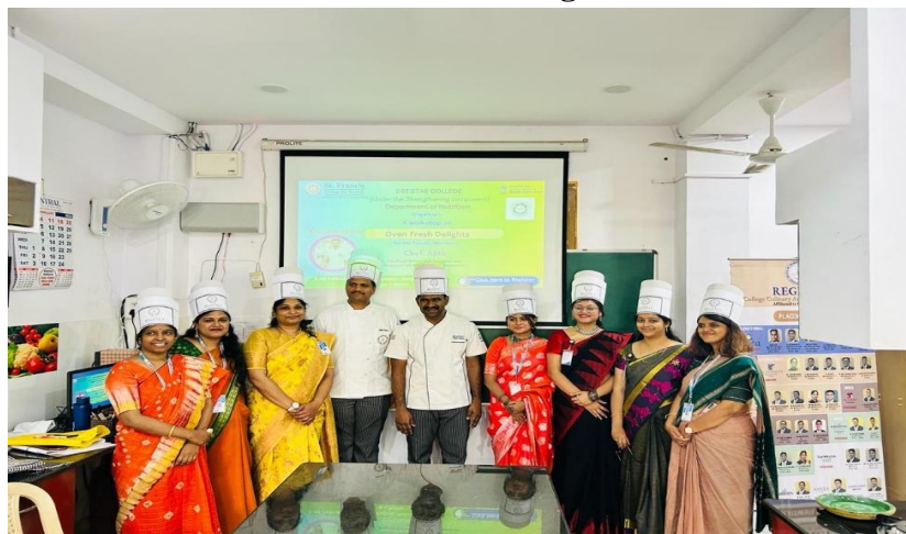
The Department of Nutrition with Chefs