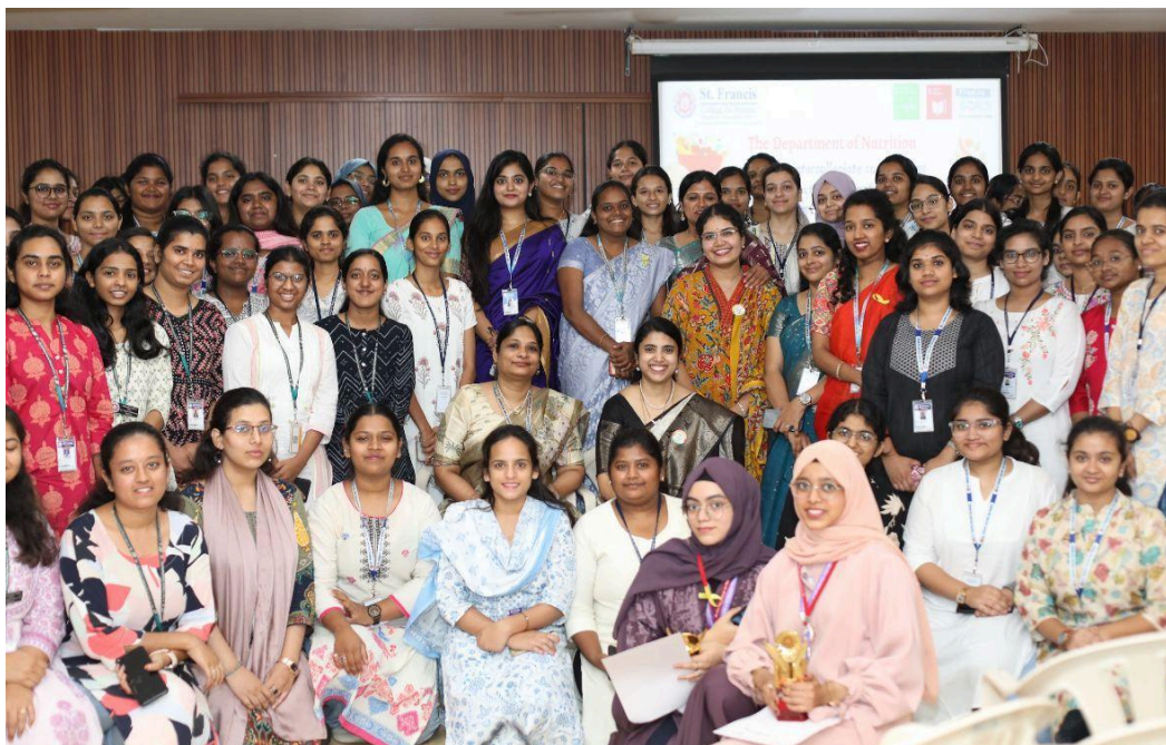
The Participants – Faculty and Students with the Guest Speaker