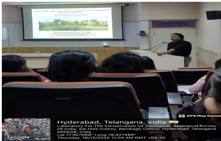
Students attending the session at LaCONES