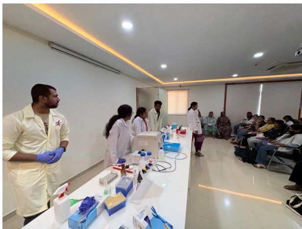
Hands-on-Session in DNA Fingerprinting