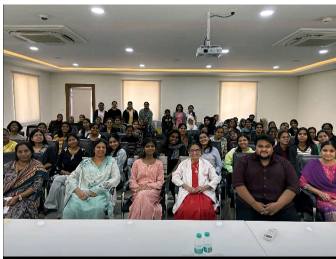
Students with the resource persons at Genome Foundation

जैवप्रौद्योगिकी विभाग DEPARTMENT OF BIOTECHNOLOGY