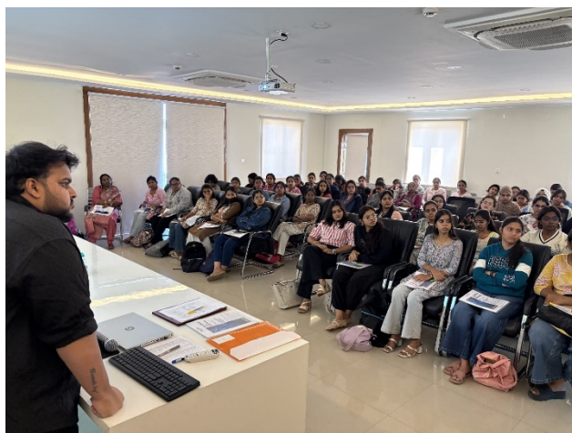
Students attending the session at Genome Foundation